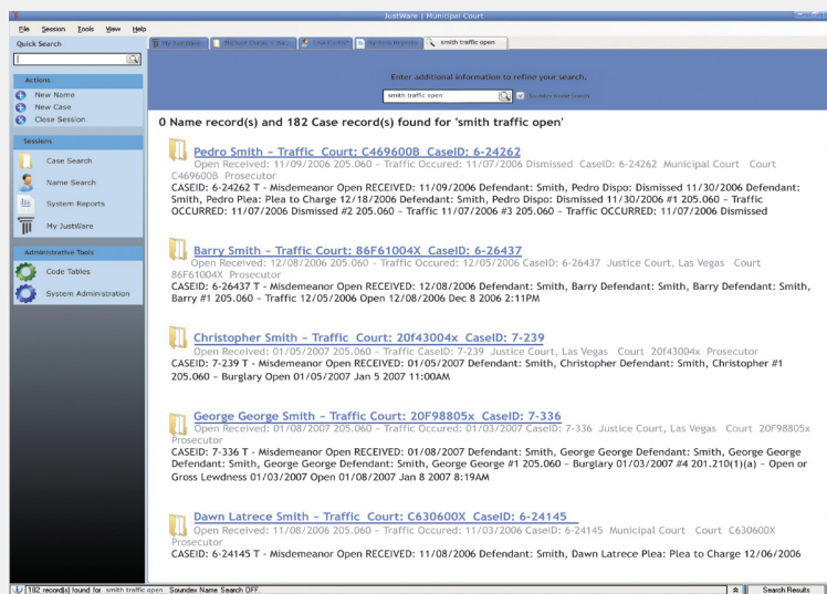
Quick Search Results